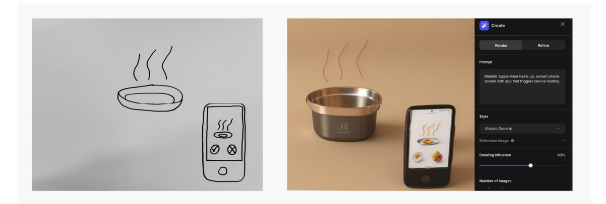
Figure 2. The left image shows the original sketch. The right image displays the Vizcom rendering of the product concept and the accompanying prompt: "Metallic Tupperware heats up, smartphone screen with app that triggers device heating"

Participants uploaded their sketches and detailed prompts using their mobile phones to the Vizcom AI, which then used its algorithms to generate visual representations of the solutions envisioned by the users. Participants were encouraged to adjust the prompt language and influence settings iteratively until they were satisfied with Vizcom's output, Figure 2.