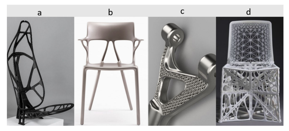
Figure 1. Generative Design Examples

The examples in Figure 1 provides a broad selection of what is significant and completed recently. It should be noted that the designer would remain in control of the development of the final product by evolving the organic potential of existing generative and topological software. Examples in the field of generative design usually involve single-part products, using a single production technology such as injection moulding or 3D printing.