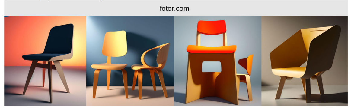
Figure 3. Text to 3D image

In a search for an AI-3D model generator Fotor.com was utilised with its potential for design concept creation of a chair. It proved useful as a research tool for this project and can help relieve aspects of design fixation, create alternative concepts and high-quality photorealistic presentations. With its Prompt text commands we requested, Plywood dining chair & Plywood dining chair with arms. The complete learning and practice process with Fotor.com including creating 4 designs was two hours. A variety of results were achieved, symmetric and asymmetric and a second design option appeared in two of the image generator attempts.