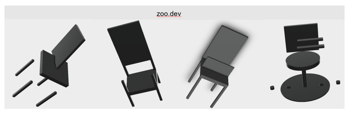
Figure 4. Text to 3D CAD

Then the potential of text to 3D CAD model was explored via Zoo.dev to create chair options from a text and prompt window and download step file products which was relatively easily. The images in Figure 4 may seem basic but this is a new technology allowing the creation of a 3D CAD model and downloadable file solely from text input. We requested: Chair; Dining chair; Dining chair with arms and a height adjustable office chair. The LLMs algorithm conducted a search and loaded some basic geometric forms to represent the product requested. We don't know the algorithm functional routine, but it seems to search for product types online then mimic objects by reducing them to basic 3D block forms. It works best for single item objects but showed potential for multiple component products too. Once this technology can access a much bigger dataset then it should start to return some more useable options for design development. This is an Alpha software development version, though it helped us to envision an integrated design tool to link early conceptual work to detailed CAD development using primarily a text prompt.