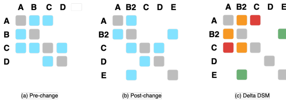
Figure 3. Construction of a Delta DSM. Figure 3a shows the pre-change condition of the system. Figure 3b shows the post-change condition of the system with changed component B2, added component E and 3 changed interfaces. Figure 3c shows the Delta DSM.

Development of a virtual experiment to validate the relationship between engineering changes and learning curves using design structure matrices