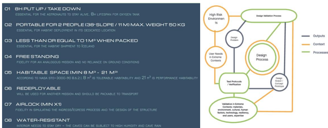
Figure 2. a) Design Criteria Hierarchy and b) Design Validation process

Design Educator’s Experience: The “mission critical” requirement was for habitat set-up to require less than 8 hours, as that is the limit of the astronaut’s portable oxygen supply. Other requirements to address include portability (load dimensions and weight) given the steepness of the terrain (Figure 1) and the need for the habitat to be freestanding within the basalt lava tube. Remaining criteria to address were the crew’s use of the volume including: “ minimal living and working space for the crew of three, for which multiplexing of areas will be vital! The space will need to provide: a hygiene area: somewhat shielded from the rest of the interior, minimal work and communications area, sleeping area, EVA suit donning, and storage (EVA suits, instruments, utilities). ” The team-developed design hierarchy had eight criteria (Figure 2a); 01-04 address survivability and 05-08 extended to habitability.