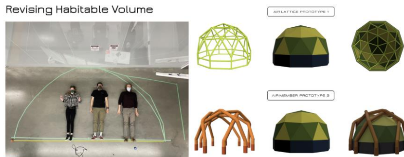
Figure 4. “FullAir’ Habitat” concept development (volume, structural testing)

Student/Project lead’s Experience: Using test protocols our simulations yielded insights for unpacking/packing the habitat from the transport bag, such as: ...difficult to grip with gloves, difficult to breathe (with mask on), heavy for user...putting the shell and floor into the bag was a struggle...5 min 10 seconds time to pack up (Criteria 01,02 and 06). In our final report, we stated that “User testing is focused on the users and how they understand and interact with the habitat. Looking at the human factors, we needed to determine; how all of the design considerations will be filtered for the end results, how the users will comprehend how the habitat will be put together, and how they will interact within it.” [12] Design Educator’s Experience: Design validation involved user testing, feedback and review of the design criteria against test results (Figure 2). This led to the teams’ concept prototypes (Figure 4).