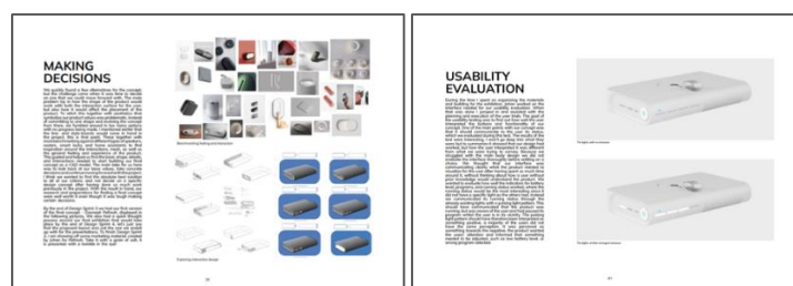
Figure 2. An extract from a D7006A Workbook demonstrating how to make decisions and perform usability evaluation. Workbook: Axel Johansson

The more traditional workbook approach is implemented in 3 courses: Form giving ; Interaction design ; Advanced Product design . The focus is on students’ describing themselves and what creative habits of mind they want to progress, the process in the different design phases, the outcomes and the results of the various phases and a final reflection, see extracts in Figure 2.