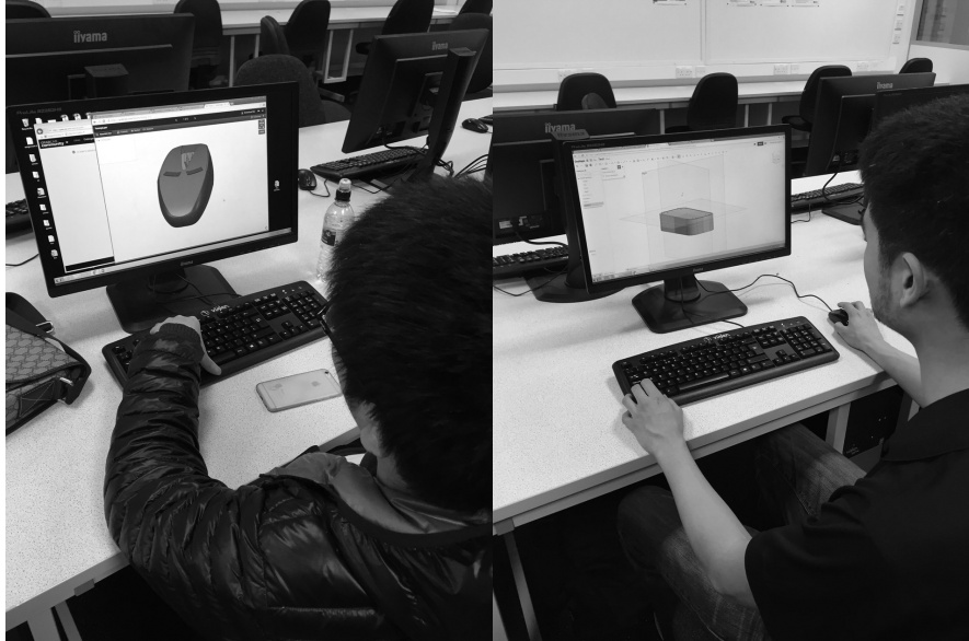
Figure 5. Students getting to grips with GrabCAD and Onshape

Postgraduate students studying ME50348 Advanced Computer Aided Design, as part of their MSc Engineering Design programme were introduced to Onshape and GrabCAD as part of their computer-based tutorials. The students were encouraged to upload their CAD designs to GrabCAD to share with the wider community. A benefit of this is that the teacher can review and keep up to date with the student's ongoing CAD development and revision changes (see Fig.5).