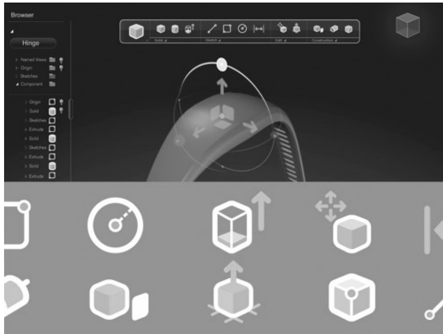
Figure 3. Fast creation and editing tools in Autodesk Fusion 360

display on any device. This satisfies face-to-face meetings but does not facilitate global collaboration where Skype would be utilized. The CAD user interface for Autodesk Fusion 360 is akin to a direct modelling approach-focusing on fast editing and model creation (See Fig. 3)