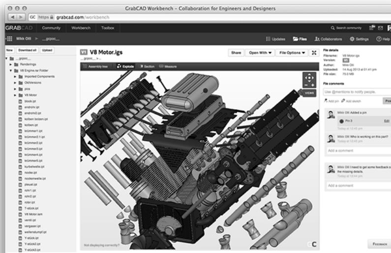
Figure 2. Web-based interface for GrabCAD

Software like Windchill and GrabCAD is distributed as Software as a Service (SaaS) and as such is not tied into node-locked annual licensing or floating licensing for CAD applications. GrabCAD, in particular exists in the same cloud-space as Google Docs and Dropbox and as such is distributed on a membership account basis. In this respect, the software (and its content) is not owned or managed by an institution, as would a traditional set of seats or licenses for CAD applications. This indicates a sea change in how students now utilize technology and drivers in the CAD market. A University could purchase 1000 licenses of a particular CAD software, but the cost of maintaining a license server, as well as 1000 high performance CAD workstations for large cohorts of students, could be problematic. Reflecting on the CAD/PDM challenges discussed by Martin Geier et al [6], a good range of mobile workstations and laptops comfortably support CAD software, and are within the budget of many students. With more students than university PC's in many Universities, there is a growing demand to support CAD and licensing remotely, and the specifications and software use on individual devices are going somewhat outside the institutions control.