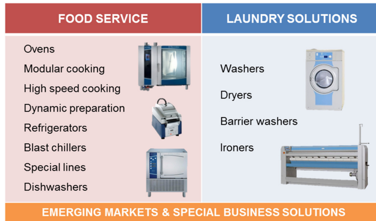
Figure 1. Electrolux professional product division

The holistic materials selection methodology proposed would be tested and validated through real applications in the field analysed (Figure 1). The investigation of different study cases will allow an extensive evaluation of critical points and emerging issues of the method developed.