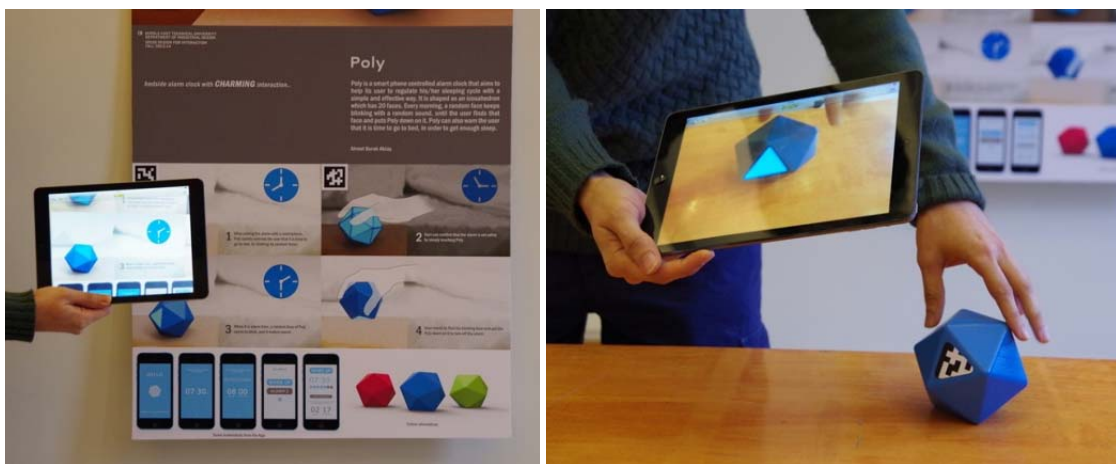
Figure 1. A participant scans the markers on the presentation board (left) then the mock-up (right) to demonstrate the augmented animation of the glowing lights on the alarm clock