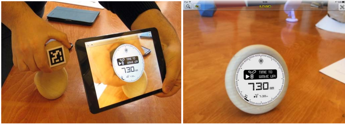
Figure 2. A participant shows interaction details through a video located on the mock-up