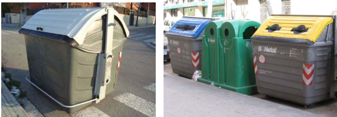
Figure 3. Left: Old container for general waste (grey). Right: Old containers for paper (blue), glass (green) and packaging (yellow) [6]

Figure 3 shows some old containers in 2004. Grey containers (figure 3, left) were not accessible to wheelchairs users and, in general, to people who could not press the pedal to lift the lid of the container and put the rubbish bag inside. Moreover, the lid was heavy and closed too rapidly upon release of the pedal. The opening in blue and yellow containers (figure 3, right) was too high to be accessible to wheelchair users. Since at that time organic waste was not collected, there were no brown containers.