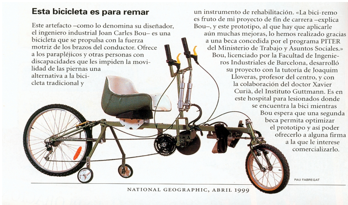
Figure 1. Prototype of rowing bicycle for disabled users.

A rowing bicycle for paraplegic users (figure 1) was designed within the framework a program of the state government [1]. A scholarship was obtained and collaboration with a medical institution for disabled people [2], some of whom took part in the project, was essential to conduct tests.