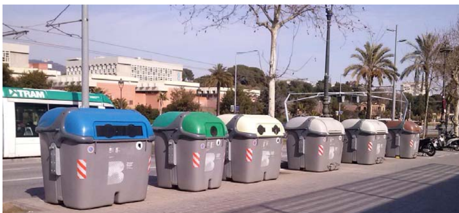
Figure 6. New containers, from left to right: blue (paper), green (glass), yellow (packaging), two greys (general waste), and brown (organic). Diagonal Av. Barcelona

Discussions about the design continued after the agreement had come to an end and some prototypes had been tested. Finally, the company decided to choose the other designs for industrial production (figure 6). The container with a lateral handlebar was selected for general waste collection (figure 4, left) whereas the container with lateral holes was chosen for paper, glass and packaging collection (figure 5, left).