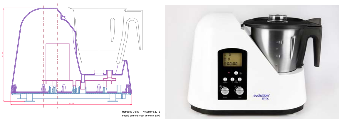
Figure 2. Left: Design of a casing (by Albert Lloveras). Right: Cooking robot

These agreements (twelve), were mostly small collaborations with local SMEs. They consisted in technical assessment and conceptual design. In one particular case, some parts of a cooking robot, including the casing, which was redesigned by a student of architecture (figure 2). The result was the improvement of the appearance of the device.