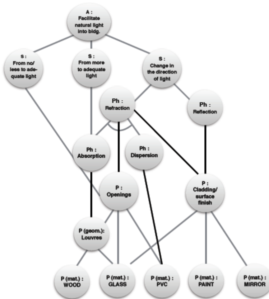
Figure 2: Environmental Impact Propagation Tree

In the Environmental Impact Propagation Tree (Figure 2), the Outcomes are represented by nodes branching off to subsequent low-level Outcome nodes. The arc connecting two (or more) branches at a node represents an ‘AND’ condition, i.e., the subsequent nodes are both part of that node. For example, the Phenomena ‘Absorption’ and ‘Dispersion’ are part of the Phenomenon ‘Refraction’.