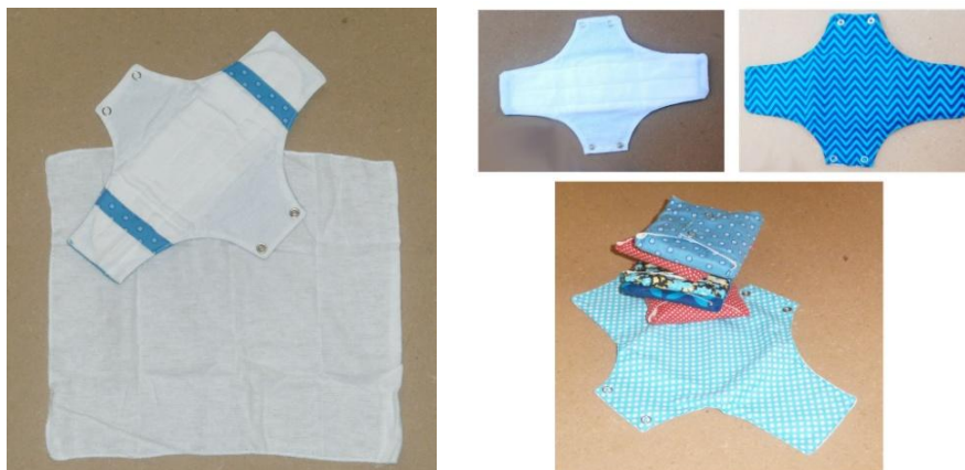
Figure no 10 and 11. Uger reusable pads made from cotton fabric

Further Brijwasi's NGO actively supported the design and research of a reusable product, a cloth option, the Uger Sanitary Pad. We worked for more than 14 months experimenting with different prototypes for a design of an environmentally sustainable pad. The final design of the pads are shown in Figures no 10 and 11, they made of cotton fabric which is both non allergic and cool to the skin. The pads button down under the underwear similar to branded disposable napkins with wings. The ongoing research on Uger pads (Murthy, 2104) have shown that these pads can be washed and reused up to 60 times in contrast to 120 to 150 disposable sanitary pads that a disposable pad user will throw away in the same time period. Huge amounts of burden on the environment are thus reduced by the use of reusable. Uger pads are now produced at a small production centre. This is run by 5 women from a lower economic community who stitch these pads, which give them a supplementary income. This is another successful example of when men have come out of their comfort zones.