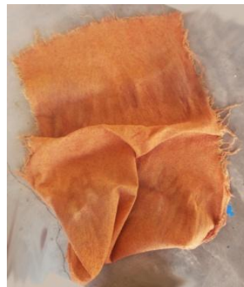
Figure 2. Cloth used for menstruation