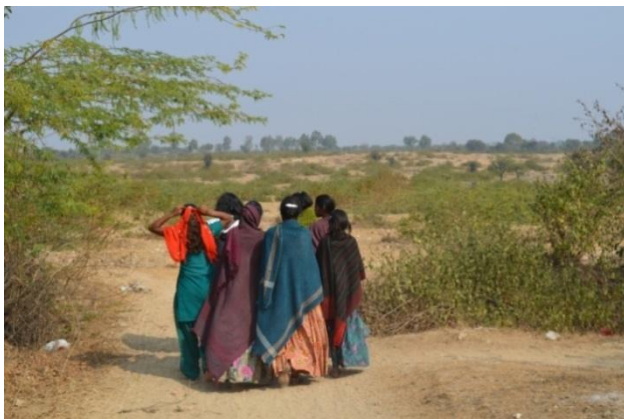
Figure 1. Rural adolescent girls going in a group

A larger picture is that an estimated 638 million people in India do not have access to toilets, (Chaudhary, 2013). A toilet is that first basic facility to manage menstruation, that first step to menstruation management design. The BBC website reported that there are more mobile telephones in Indian homes than toilets (Phones, no toilets, 2012), all pointing to economics, attitudes and aspirations, all of which govern and motivate the different actions of communities. Other researchers too have pointed out that motivation is a factor governing creativity (Chakrabarti, 2010). To understand this further we can examine Indian society. It has up to now sanctioned open urination for men, defecation is seen as a five minute job behind the bush, so there is no motivation to direct energy, creativity, money or time toward menstruation management design for women. Priorities are different, peer pressure is also a factor that decides what is spent in a family, for example a motor cycle will be purchased over construction of a bathroom (Murthy, 2014). At the end it is women then who bear the brunt, taking in all the inconveniences and danger in silence.