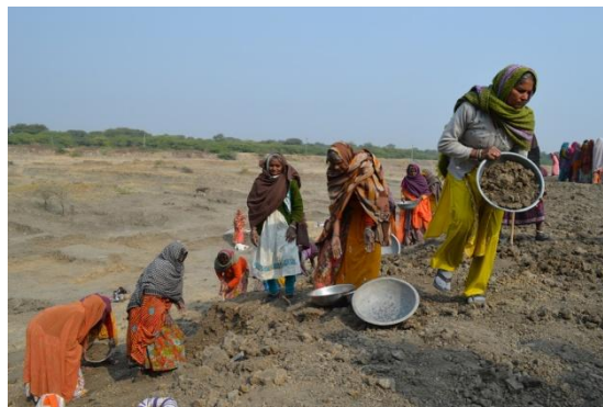
Figure 5 Women at work site.

We visited a government construction work site location, where we spoke to 8 women working on an embankment project. These women leave home early in the morning in order to reach the work site on time. They spend the whole day working here even when they have their periods. We saw that at the work site there was no space or shelter to change their menstrual cloth, with the closest tree cover 800 meters away. See figure no 5. Additionally there is no running or stored water or soap for washing hands or washing their menstrual cloth. A small bamboo shelter may have sufficed as a temporary measure but even that was missing.