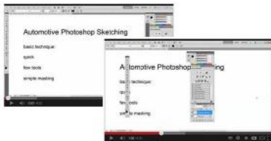
Figure 1. PS interface layout

The first video in the series explains the PS interface layout, orientation and optimisation for sketching purposes ( Figure 1 ). Subsequent videos convey basic PS sketching techniques tailored to allow students to transfer previously-gained manual sketching methods to a digital format ( Figure 2 ). The videos build to form a library which students can access at any time.