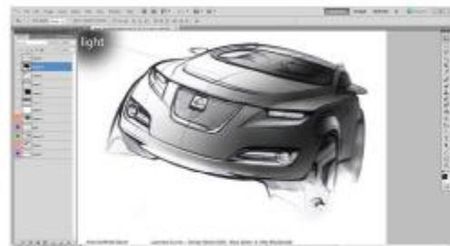
Figure 2. PS shading techniques

These recorded tutorials differ from other video tutorials available on Youtube.com or through other web 2.0 enabled channels, because they offer a structured and incremental approach to learning. The video library also includes examples of more advanced techniques, enabling more advanced students to find appropriate material, which, due to time constraints, cannot be covered in the 'face-to-face' demonstrations. The videos also maximise the value of 'face-to-face' demonstrations: the latter are recorded and edited for inclusion in the video library to capture both students' questions and Author 3's spoken guidance.