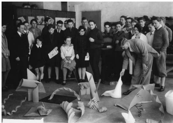
Figure 1. Albers with his Volkurs course students

Perhaps the first well-known example of paper folding as a design learning activity was assigned by Joseph Albers in his Volkurs course at the Bauhaus. [Figure 1] He asked his students, through tacit exploration, to discover paper material properties and potential as they created folded objects for study and reflection. Students' results revealed underlying properties of paper that demonstrated potential exploitation as a design medium. [1]