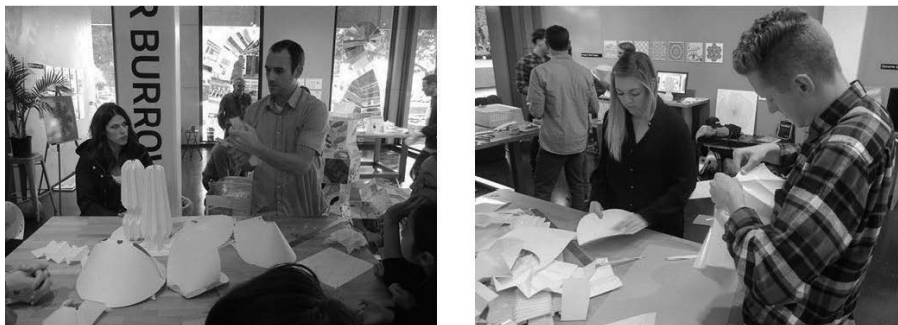
Figure 4. Student volunteers instructing; participants at 2 nd lamp making workshop with folding emphasis

or demonstrate an approach that the student determined would be helpful. Folding instruction included: scoring, mountain and valley folds, regularly dividing surface space, types of pleating, crumpling, twisting, and the basics of cone, bowl, and box construction. We also briefly demonstrated, as in the first workshop, attachment possibilities including: tabs, weaving, rivets, snaps, sewing, eyelets, grommets, and clips. Again using polycarbonate sheet as the primary sheet material. Emphasizing folding as a design and making activity enabled participants to progress further than in the non-folding workshop. It appears their production benefitted from a more focused direction and greater skills toolbox to draw from. Although it's unlikely the participants were completely lacking folding experience, we believe the folding instruction could have provided the participants with some new information that developed into skill acquisition during the workshop. [Figure 4] Folding activity also produced an enhanced atmosphere of energy and excitement, as well as open sharing with a general attitude of play.