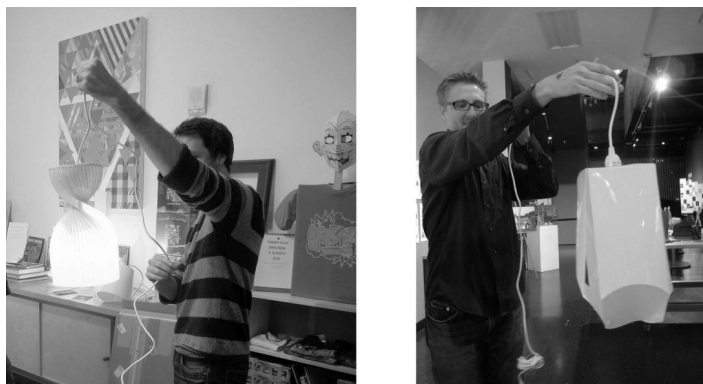
Figure 5. Participants show results from 1 st (left) and 2 nd (right) workshops

Some of the written review comments we received from the participants expressed their perceptions this way: “It was fun, pushed my creativity, great materials and tools. Tactile/hands-on learning experience.” “I am a bit impressed with my ability to go from an idea to a tangible working product.” “Exploring ideas through quick physical prototypes is more informative than ideation sketching in terms of how elements come together.” “My project changed three times over the course of an hour—this was a great opportunity to explore the materials with minimal risk.”