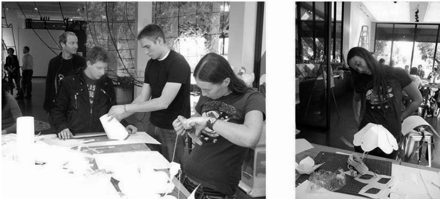
Figure 3. Participants and student volunteer at 1 st lamp making workshop

Student volunteers acted as coaches, assisting participants with technique and how-to type questions, and helping participants reflect [6] on the process of designing/making as it was occurring. The professor and students were able to provide individual attention to participants as the venture progressed. This interaction allowed the students to be the “instructor” for a time, which many reported, “opened their eyes” to the learning dynamic as it related to their university studio experience. [Figure 3]