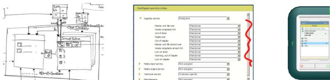
Figure 2. A hand sketch made in a meeting (left), a digital sketch made with Microsoft Sketch Flow (middle) and a screen shot from a clickable demo by interaction designers (right)

The communication between interaction designers and visual designers is for collaboration. They think that pen/paper sketches are the most suitable medium for this kind of communication. The aim of this process is to understand each other and to generate a joint idea about the design direction. Thus in this process they not only sketch to show their ideas but also to show how they interpret ideas of each other.