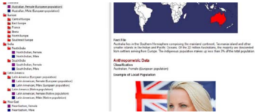
Figure 2. Images to illustrate the context of existing data

The second step was to add images to illustrate specific measurements, such as the use of arrows in Figure 3 to denote the distance for measurement. This allows designers to understand the associated terms in a simplified way.