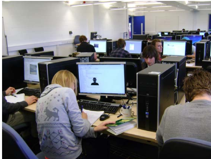
Figure 5. Evaluation with design students

Following the development of ErgoCES, the next step was to undertake a series of evaluation studies with design students and professionals. This took place over a period of two months, involving 39 final design undergraduate students at Brunel University, 5 MSc (Integrated Product Design) students, and 39 professionals (designers, design researchers, and ergonomists from eight companies and organisations). In each session, a brief demonstration of the ErgoCES tool was given to the participants before allowing time for a hands-on experience. The students were provided computers that had the pre-installed tool (Figure 5).