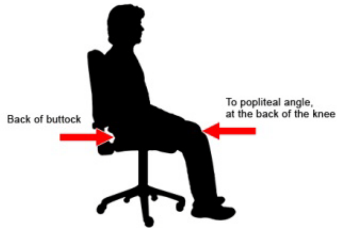
Figure 3. Figures with measurement indicator arrows

The second step was to add images to illustrate specific measurements, such as the use of arrows in Figure 3 to denote the distance for measurement. This allows designers to understand the associated terms in a simplified way.