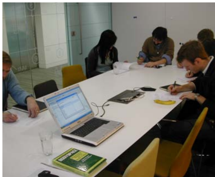
Figure 6. Evaluation with professionals

For the professional evaluation, laptops were used as a more portable medium (Figure 6). In both student and professional testing sessions, the same version of ErgoCES was used.