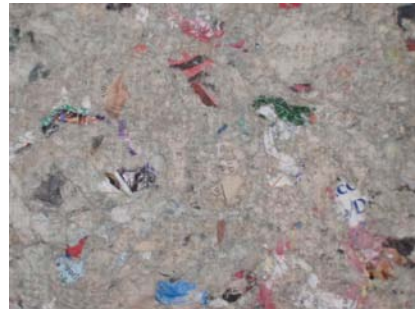
Figure 2: Paper mass

The specific idea, illustrated here, uses recycled paper blocks, a raw “waste” material not currently recycled centrally in the author’s neighborhood. An informal recycling system was already in place, where the author gathered the paper refuse of near neighbors and transported them collectively to a paper recycling facility near to their place of work. This community based project highlighted that people were willing to recycle and, in fact, wanted to become more involved in this process, despite a lack of support from the central state. The concept of this waste as a material emerged, following research into sustainability in the context of interior design and as such the initial action was to explore creation of a series of paper blocks. They were magnificent, warm to see and to touch, with a neutral colour overall, but some vivid areas of white paper, together with splashes of colour from the pages of magazines, also evident (See figure 2). Feedback from those involved was very positive as the concept eliminated both products and processes known to pollute air, water or earth. In addition participants identified potential benefits of the process in terms of social equity at local and global levels as well as the inherent protection of the biosphere as a result of recycling of materials.