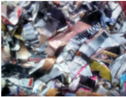
Figure 1: Waste paper

A rational course of action for an urban designer is the utilizing of the waste provided by the city. An easily applicable pattern would be asking people in a local neighborhood to collect their newspapers and magazines, rather than disposing of them in their rubbish. (See figure 1)