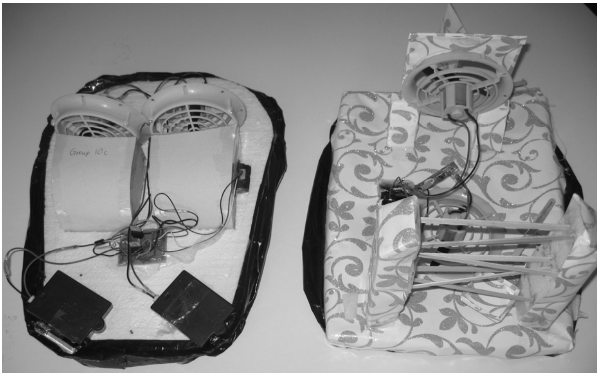
Figure 3. Two examples of hovercraft produced by the student teams

Timed mechanism devices included use of a 555 timer circuit to actuate a fan at a specific time, to control thrust flaps to provide thrust in a particular direction. A variation of the timer circuit that negated use of a 555 timer was a fuse wire connected to a power source, which was sized such that the fuse link burned through after about 5 seconds, compatible with the design's requirement to begin to turn right.