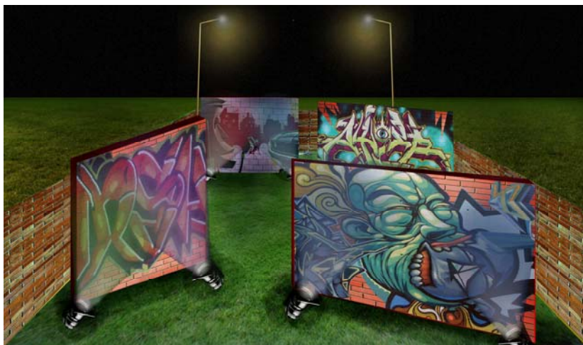
Figure 5. Student Design Solution for Calton

The solution attempts to reverse the negativity of vandalism by putting it to positive use. The group propose an outdoor graffiti gallery in Baird Square to encourage the use of a designated space for this activity and to detract potential vandals from defacing the public realm elsewhere. The space would be brightly lit in hours of darkness and is intended to facilitate a sense of ownership and responsibility. A visualisation of the concept is shown in Figure 5 below. Although the concept has its shortcomings the creative approach helped the group to consider means of making positive contribution by directly utilising a negative issue and could perhaps have a more positive effect if implemented as part of a package of measures. Alternatively, the idea could be implemented as part of a community scheme like Graffiti Art Programming [10] in Winnipeg, Canada which aims to promote the positive aspects of youth art and to provide environments for young people to express themselves creatively.