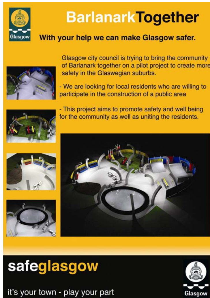
Figure 3. Student Concept Poster for Barlanark Design Solution

In this case the students have understood that the improvement of public places can have a significant impact on the conditions of life within communities and can instil a sense of civic pride in residents and convey a much improved social image as corroborated by Madanipour [6]. The recognition of this can be contributed to the creative approach the group took to addressing social issues by exploring the root causes of such issues and arriving at a concept which not only reacts to problems but could also provide the means to make progress. CABE [7] highlights how the maintenance and design of parks and public green spaces affects people and uses The Hub in Regents Park, London as a positive example of such a space. It is important to aspire to have similarly praised examples of public parks and spaces in more disadvantaged areas.