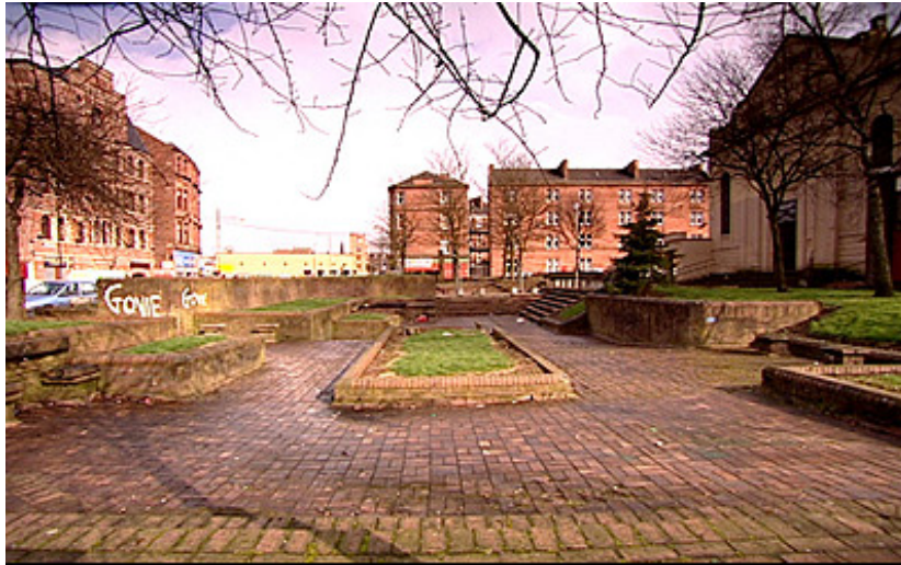
Figure 4. Baird Square, Calton