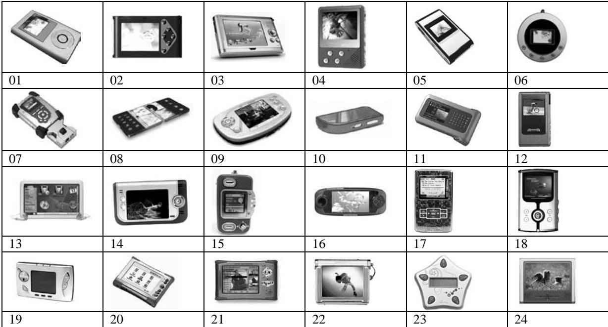
Figure 1. Media player samples

The aim of the experiment was introduced to the subjects. Then the samples were projected on the white wall one by one. The subjects were asked to evaluate the samples according to the mental measurement scale. This experiment was conducted in a quiet room, and each candidate was asked to complete it on their own.