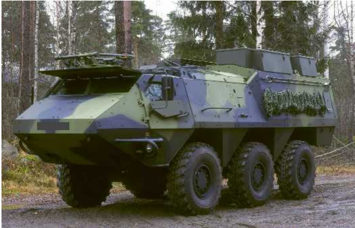
Figure 1. XA-series product family

The case product was the XA-series of armoured wheeled vehicles. Patria Vehicles Oy delivers 5-14 different variants of XA-series every year and the total amount of product individuals is 80-120 per year. Figure 1 is a picture of one individual of XA-series product family. [www.patria.fi]