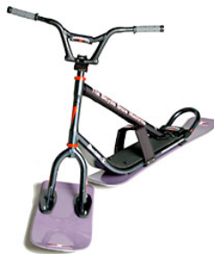
Figure 2 Base version (initial design) of the sporting gear (Snowscoot) [11]

In summary: this project of POLE Europe had a complex scope which could only be solved in teams of graduate students, who integrated knowledge from their faculties of mechanical engineering, plastics technology, light weight design, economics, marketing, industrial design and process management. For the whole development process, from testing of the existing base version until test drive of the new prototype, the teams only had a time budget of 14 weeks.